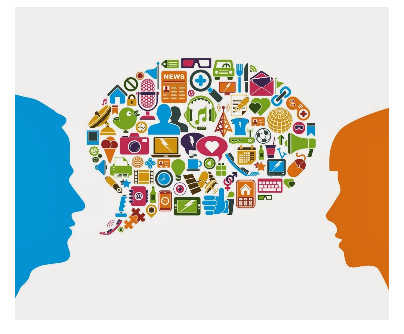
Please remember, we have several ways you can get in touch: