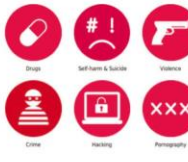
A Parent's Guide to Privacy Settings