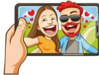
A Parent's Guide to Sharing Pictures