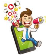
A Parent's Guide to Live Streaming