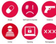
A Parent's Guide to Privacy Settings