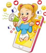
A Parent's Guide to Online Influencers