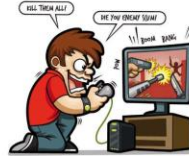
A Parent's Guide to Gaming