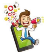
A Parent's Guide to Live Streaming