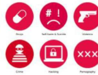
A Parent's Guide to Privacy Settings