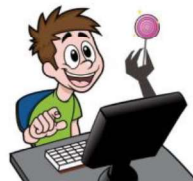
A Parent's Guide to Online Grooming