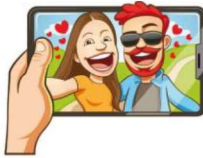
A Parent's Guide to Sharing Pictures