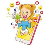
A Parent's Guide to Online Influencers