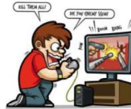
A Parent's Guide to Gaming