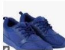
Plain trainers, or trainer-style shoe