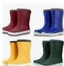
Wellies (kept in school) Water-proofs: jacket with hood or puddle-suit (kept in school if possible)